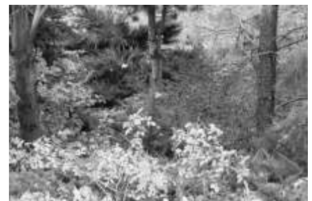
Spruce, rose and burning bush at the base of a slope